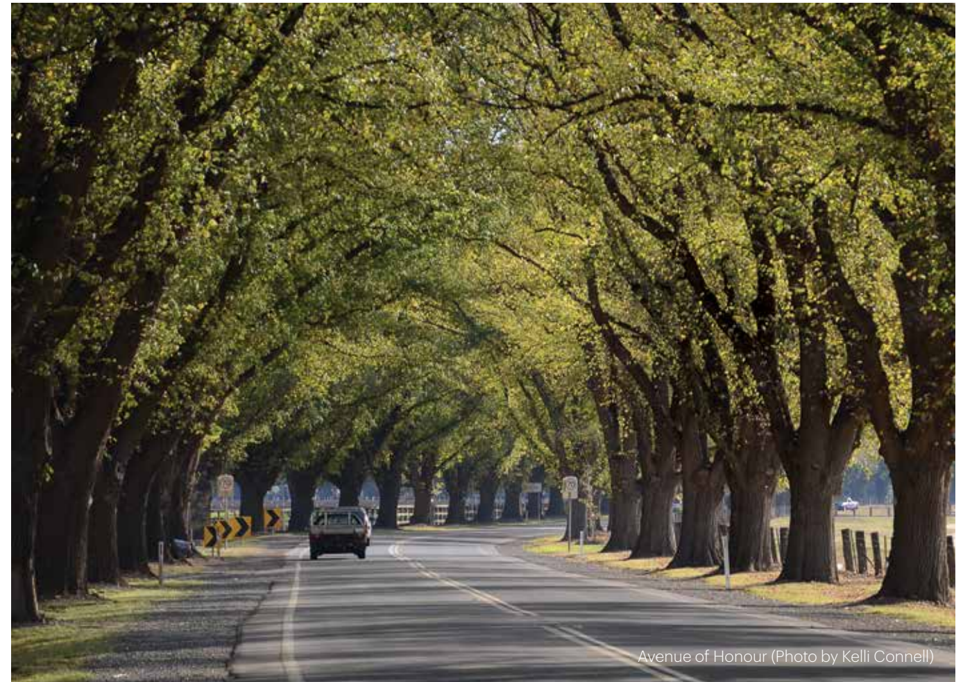
Avenue of Honour

The Bacchus Marsh West Golf Club and numerous recreational facilities all provide places to keep fit and enjoy the great outdoors.